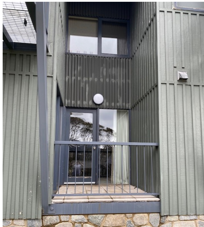
Image of existing balcony space to be enclosed.