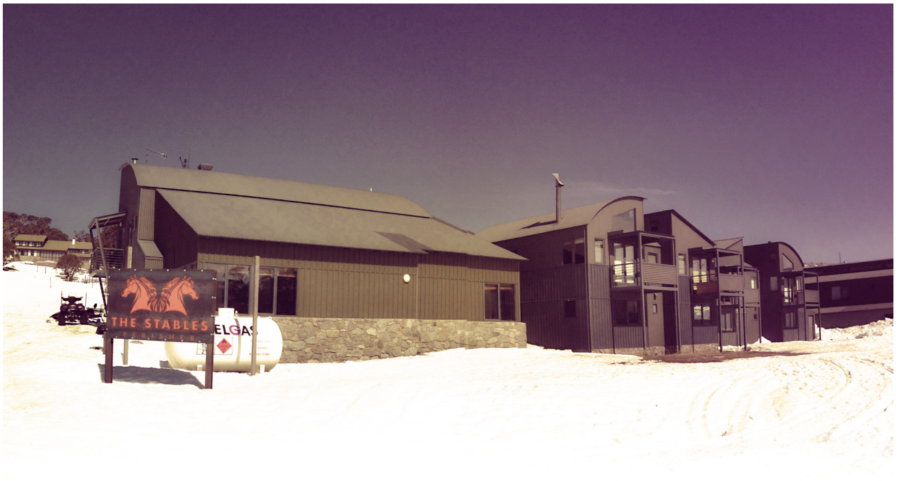
View of existing restaurant and accommodation from Candle Heath Road.